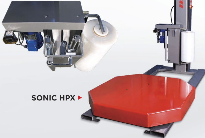
SONIC HPX ▶

The X-TRETCH pre-stretch film carriage provides superior film economy, film tension and user safety.