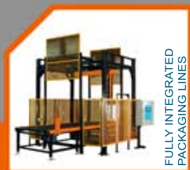
FULLY INTEGRATED PACKAGING LINES