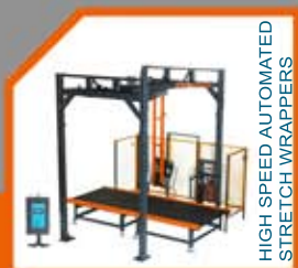
HIGH SPEED AUTOMATED STRETCH WRAPPERS