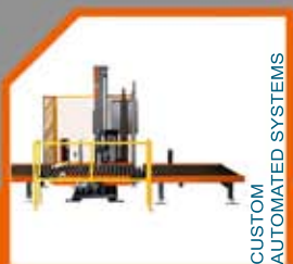
CUSTOM AUTOMATED SYSTEMS