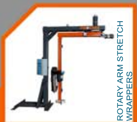
ROTARY ARM STRETCH WRAPPERS