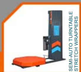
SEMI-AUTO TURNTABLE STRETCH WRAPPERS